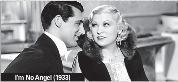
I'm No Angel (1933)