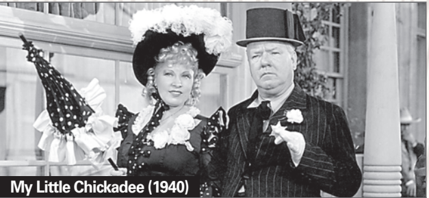
My Little Chickadee (1940)

4 8a The Four Musketeers (1975) 10a Riff-Raff (1947) 11:45a The Importance of Being Earnest (1952) 1:30p The Roman Spring of Mrs. Stone (1961) 3:45p Light in the Piazza (1962) 5:45p Cass Timberlane (1947) 8p Night After Night (1932) 9:30p She Done Him Wrong (1933) 10:45p I'm No Angel (1933) 12:30a The Adventures of Prince Achmed (1925) 2a Chinese Odyssey 2002 (2002) 4a Walkabout (1971)