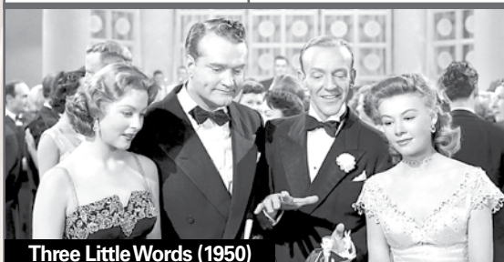
Three Little Words (1950)