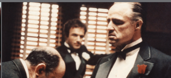
The Godfather (1972)